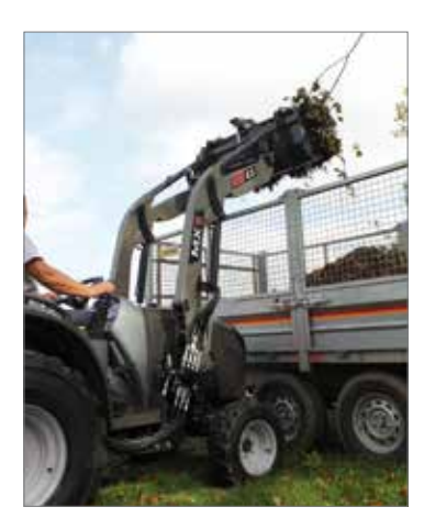
INTEGRATED HYDRAULIC CIRCUIT The hydraulic piping is fully integrated into the boom for complete protection against shocks.

MAXIMUM LIFT HFIGHT AND REACH One of the main attributes of MX COMPACT loaders is maintaining the compactness of the tractor/loader units, whilst acheiving the maximum lift height and reach to easier dump materials into high trailers and stack pallets.