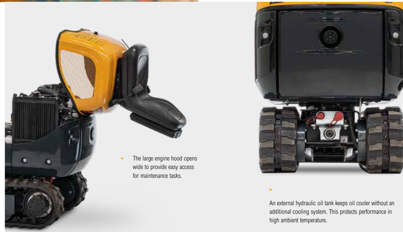
◀ The large engine hood opens wide to provide easy access for maintenance tasks.